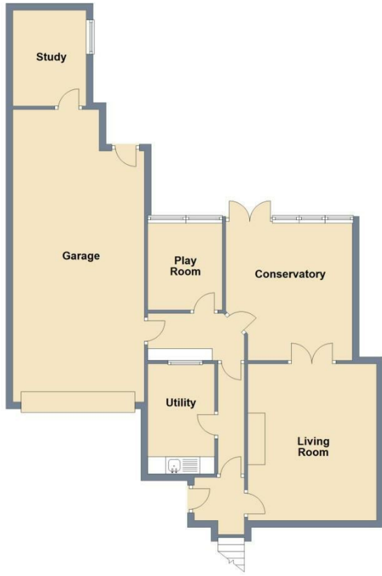
Lower Ground Floor Approx. 59.2 sq. metres (637.6 sq. feet)